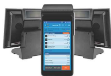
PAY AT COUNTER