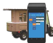
PAY IN FIELD