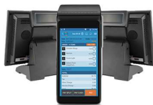
PAY AT COUNTER