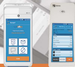
PAX A920 CLOVER FLEX

Extend your Point of Sales with DataPoint's built-in ability to take orders anywhere with the same menus your staff is accustomed too.