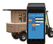
PAY IN FIELD