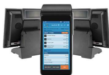
PAY AT COUNTER